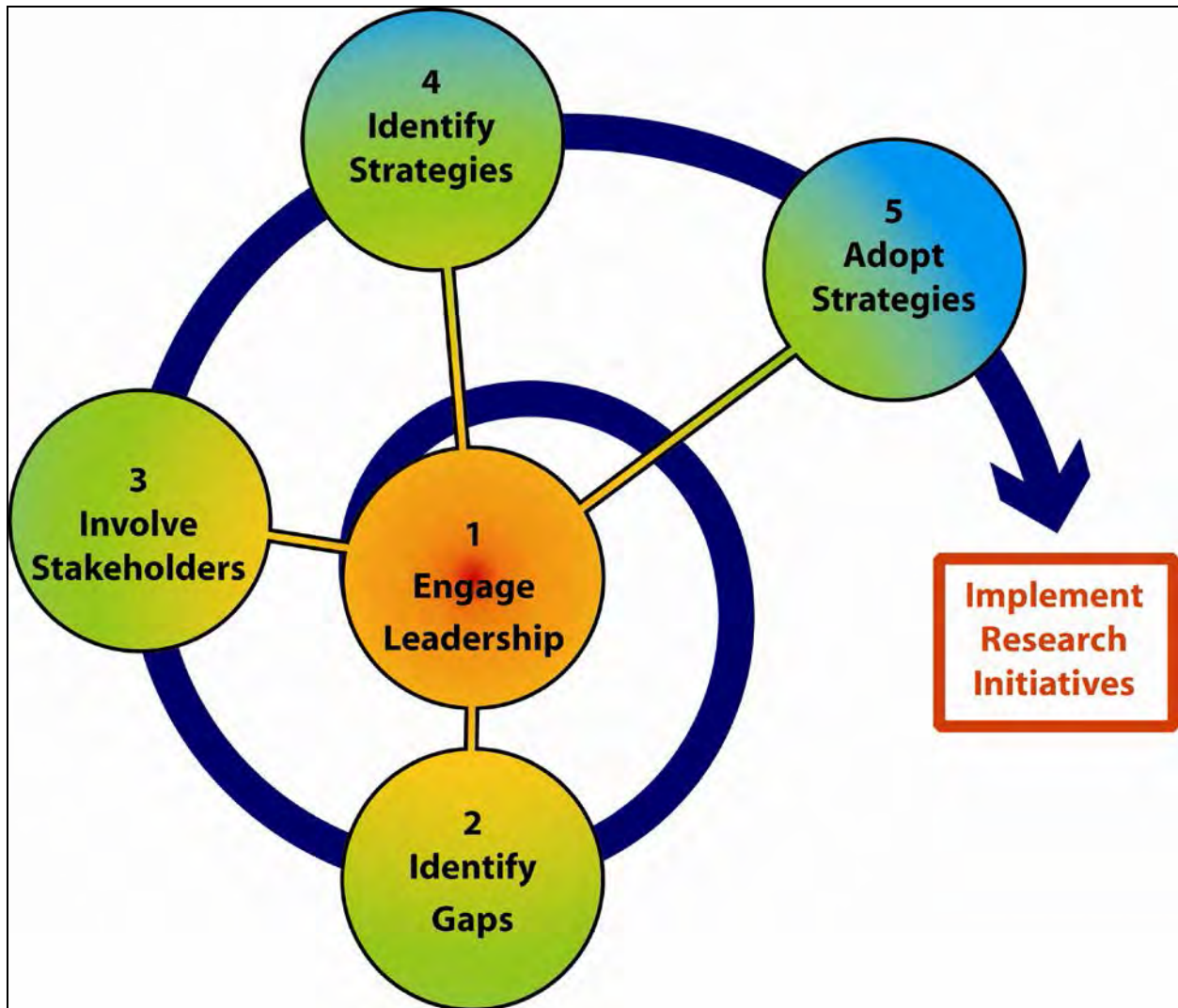
Figure 1. Model of the CBCRP Special Research Initiatives Strategy Development Plan

The Strategy Development Plan for the CBCRP's Special Research Initiatives is divided into five phases [see Figure 1]. The five phases are designed to gather focused, innovative ideas, and ensure that all relevant resources are brought to bear on the problems addressed by the Special Research Initiatives.